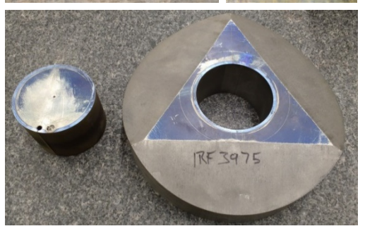
Figure 2: The niobium pieces after EDM. Clockwise from top left: The centre body piece, the offcuts, and the end cap piece with offcut.

RF simulations with thermal feedback have been performed using ANSYS, showing no significant temperature rise of the RF surfaces, and good stability to normal conducting defects up to 100 µm diameter at 0.6 MV deflecting voltage. Cooling channels machined into the