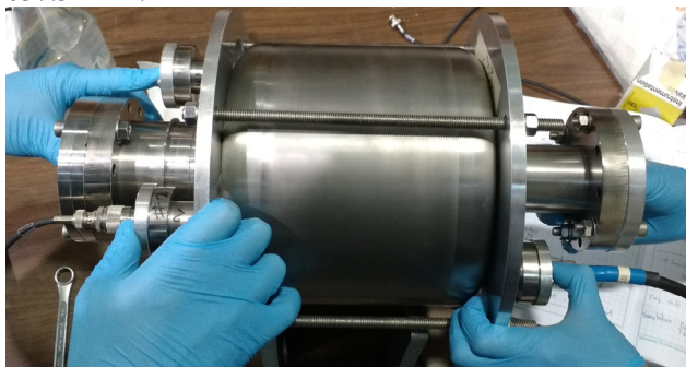
Figure 5: Initial RF stack up of un-welded components.

Frequency measurements are performed using a jig designed to hold the individual pieces together without deforming the cavity shape. Figure 5 shows the first RF stack up measurement performed before any welding or trimming was completed, yielding a frequency of 637.3 MHz.