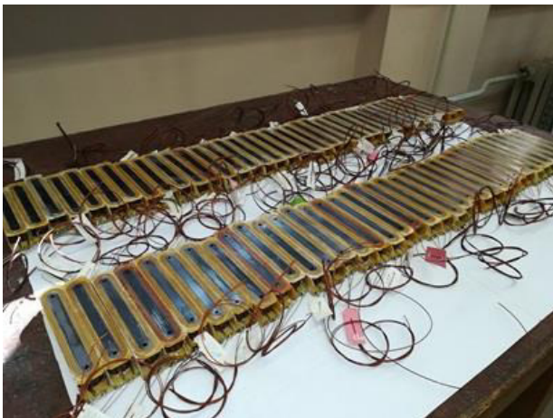
Figure 5: Superconducting coils for 3 T SCW.

By this moment all poles for two SCWs and magnet yokes had been manufactured. Presently a producing of cryostats is under way. Superconducting coils are shown in Fig.5 before installing on magnet yoke. Magnetic measurements of fully assembled SCWs will take place in the end of 2018.