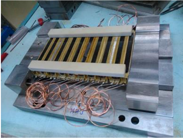
Figure 4: External view of the SCW prototype magnet.

cryostat. After some quenches and coil training field level of 3.8 T was achieved. This level is far above designed value. Maximal field inside the cryostat with indirect cooling will be slightly less but still more than 3 T. The magnetic measurements have demonstrated good accordance of the designed field parameters to calculated ones. View of one half of the prototype magnet is shown on Fig.4.