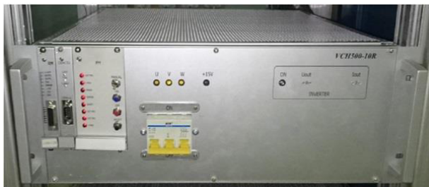
Figure 2: External view of the wiggler power supply.

The wiggler has 4 power supplies to provide acceptable current in superconducting coils. The power supplies has maximal current 300 A and maximal voltage not less than 10 V. Four supplies instead of two are used for minimizing current through cryostat current lead and for decreasing by half heat dissipation inside non-superconducting solder contacts. The power supplies have stability \Delta I/I not more than 2 \cdot 10^{-5} and 16 bit resolution for current control. This power supply was specially constructed for stable operation with low inductive load. Maximal time for growing and decreasing of the field between 0 T and 3 T does not exceed 5 minutes. Relationship among the currents in power supplies for any field level is determined after magnetic measurement under condition of zero field integrals. Inner sections of the central poles are fed from one pair of the power supplies while outer section is fed from all 4 supplies. The current is introduced to cryostat through special HTSC rods. External view of the power supply is shown on Fig.2.