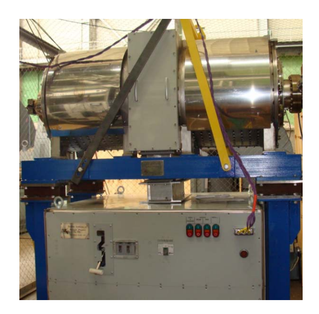
Figure 3: RF station on the test bench.

frequency range of 0.5 - 5.5 MHz is obtained. In the end of September, 2014 the stations have been sent to the customer. Test of stations at the customer's site is planned in November.