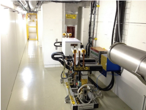
Figure 1: Irradiation tables (front) and shuttle system (back) in the IRRAD irradiation zone.

of communication, Ethernet-to-Serial devices have been installed in the facility, providing multiple RS232 serial ports. This allows computers running the control system software to communicate through multiple virtual COM ports. One control box per IRRAD table containing the microprocessor and control buttons is installed in the IRRAD control room for manually controlling the tables. However, this particular setting requires the presence of operators in the control room and induces some limitations on the type of actions that can be performed.