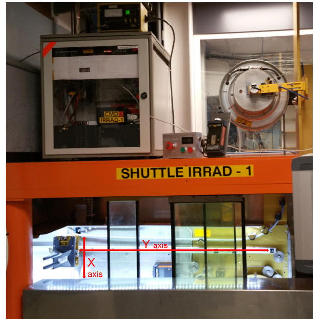
Figure 2: Shuttle system, part outside of the irradiation area, where the samples are loaded.

The software technologies used in IRRAD have to be compatible with the hardware located in the facility. Moreover, since IRRAD is a small-scale infrastructure with limited manpower and software expertise, some lightweight and easily maintainable control-software solutions are required. In the first IRRAD run, the control system GUIs that were used were developed using Windows Forms [4] and coded in C++ and C#. Even though the interfaces were considered operational and user-friendly, limitations and dependencies on specific operating system and proprietary software pre-