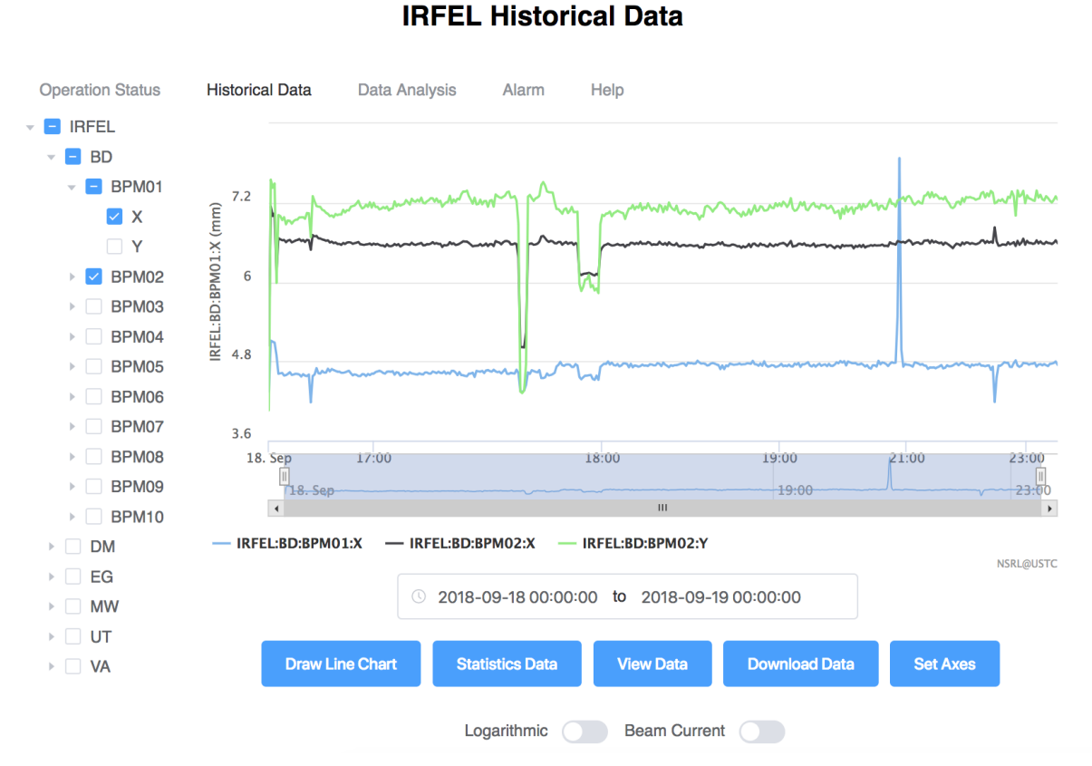
Figure 3: Screenshot of the Web-Based GUI.

end. The design of the complete separation of the front and back end is also convenient for future expansion, like adding new data types and adding new methods for interaction with users.