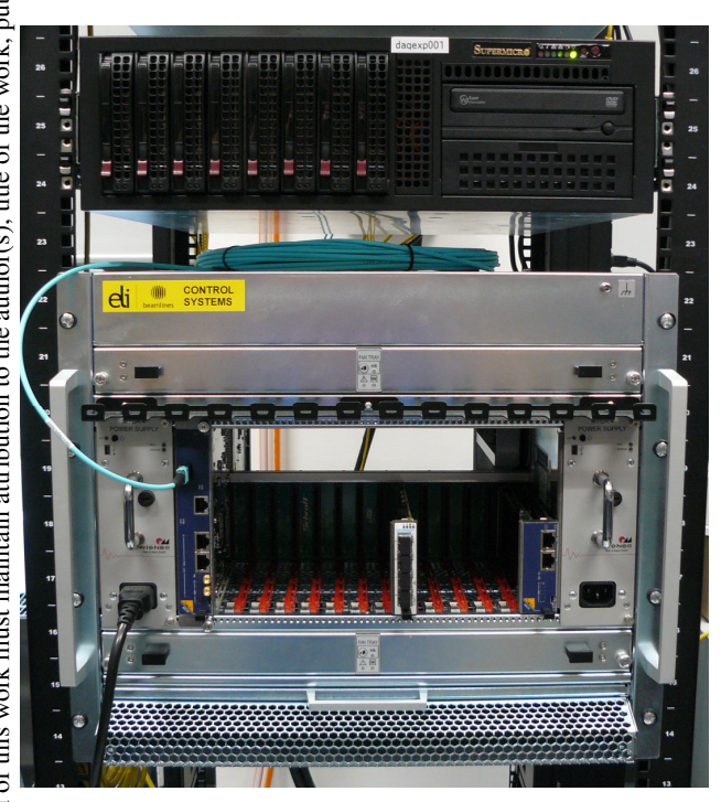
Figure 3: Connection between MTCA and PC based system.

(shown in Fig. 3) provides PCIe x16 interface and can be implemented using PCIe on MTCAs' agnostic backplane and its fat pipes.