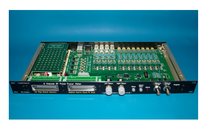
Figure 1: Eight Channel Power Meter

The SNS eight-channel pulsed power meter is shown in Figure 1. The system supports simultaneous monitoring of 8 RF channels and 4 DC or analog channels. It can be locally controlled via the front panel or by remote communications. Remote communication is supported with 10/100 Ethernet and RS-232. Interlocks were added to support a simple protection scheme based on overpower detection. Two monitor ports are available to the user so that any of the ADC channels can be routed to the front panel via two 16 channel analog multiplexers.