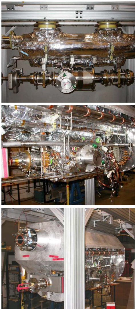
Figure 3: HTC module assembly. Top: Beam line string supported by HGRP. Middle: After adding of 5K and 80K tubing. Bottom: Nearly closed 80K shield.

with coupler processing as observed during prototype coupler test. Insight gained from the HTC assembly has been applied to the full injector module design to reduce cost and simplify module assembly further. Overall, the choice of building a single-cavity test module first has been highly beneficial.