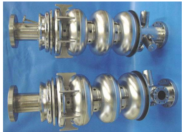
Figure 2: Two 3.5 cell cavities with the RF choke, the pick-up, the power couplers and the HOM coupler.

TESLA cavity [3] and one extra pick-up especially for the cathode half-cell (fig 2).