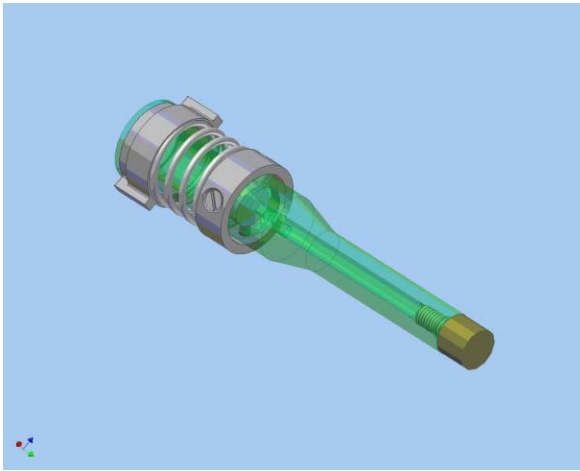
Figure 3: Photocathode design for the SRF gun.