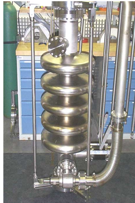
Figure 1: APT 5-cell cavity set on the cryostat insert.

Note: the values in the parentheses are for LANL and AES cavities.