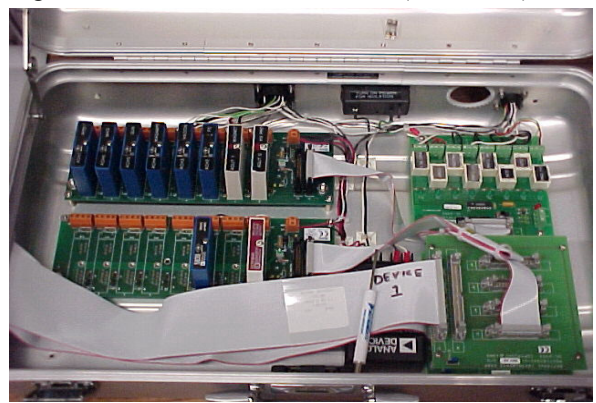
Figure 2: Isolation components and portable case.

Signal isolation (Figure 2) is accomplished by incorporating NI-provided 5B08 backplane, 5BXX series analog I/O isolation modules (left side), an