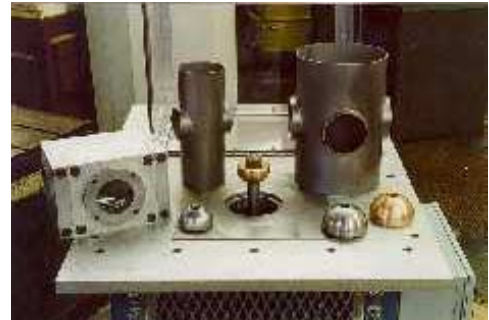
Tube Branch Pulling Machine and Test Samples

An internally funded R&D program to fabricate two single cell cavities preceded successful manufacturing of the 5-cell cavity. As a result of this development work, AES employed a hydroforming process for half-cell production in the 5-cell cavity. In this case, hydroforming was more cost effective than the traditional deep drawing and also reduced wrinkling in the niobium. AES also designed and built a hydraulic branch pulling machine for LANL to form the drawn tube branches required in the beam tubes. This very successful machine has since been duplicated for Argonne National Lab (ANL) to support their superconducting accelerator efforts.