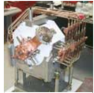
MXIS Electron Gun (Fabricated at AES to BNL Gun IV Design)