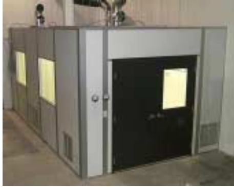
AES Clean Room

vacuum furnace brazing, electron beam welding, electroplating and electroforming, as well as others.