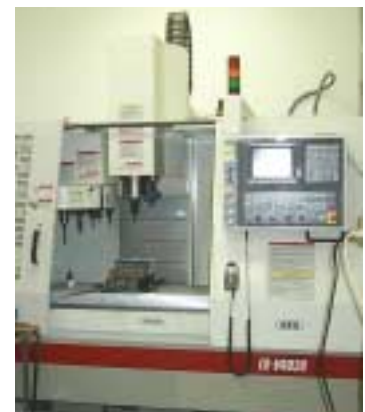
Okuma 40'' x 20'' x 20'' CNC Machining Center

Advanced Energy Systems maintains prototype and limited production manufacturing capability in 3200 ft 2 in the Medford, Long Island, NY facility. Our equipment includes state-of-the-art CNC milling and CNC Turning capability as well as a large assortment of smaller NC and manual machines. AES maintains a temperature controlled machining area that houses the CNC Mill and CNC Lathe in order to achieve the tolerances necessary for our ion and electron accelerator products. In addition to precision machining, we have capability for sheet metal forming and fabrication, TIG, MIG, stick, gas, and orbital arc welding for ultra-high vacuum service, and vacuum leak testing services with capability to 1 \times 10^{-11} scc/sec. We also maintain optical and laser metrology capability for precision assembly and installation.