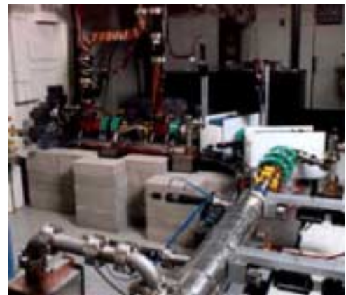
Compact IR FEL Designed and Built by AES (current location Univ. of Maryland)

AES is actively involved in the development of free-electron lasers (FEL) for commercial, military and R&D applications. AES can supply compact room-temperature FEL systems, such as the mid-infrared FEL (MIRFEL), which has lased with ~ 0.5 W from 7-20 \mu m. These devices can provide high-peak-power, tunable radiation for research, medical, biomedical and material processing applications. A wide parameter space across the complete IR spectrum can be accommodated with this type of low energy device that can be tailored to suit particular customer requirements.