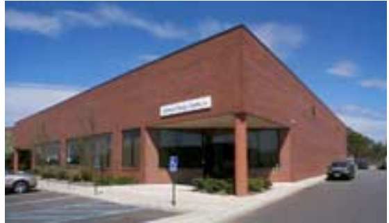
AES Headquarters in Medford, NY

On September 28, 1998, the former employees of Northrop Grumman's Advanced Energy Systems Group completed the formation of a new small business, Advanced Energy Systems, Inc. (AES). Incorporated in New York and purchased from Northrop Grumman as a legacy organization, AES retains all former assets including the skilled personnel, intellectual property, accelerator development laboratories, prototype machine shops, computational analysis systems and contracts. The new company can draw upon a 22-year experience