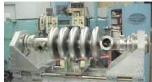
AES 5-Cell 700 MHz S/C Cavity built for Los Alamos National Lab.

AES has a long history of demonstrated performance as a supplier of superconducting accelerator systems and components. Between 1992 and 1996, as part of Northrop Grumman, AES was the responsible group for the manufacture of 373 superconducting dipole magnets and 432 quadrupole cold masses for Brookhaven National