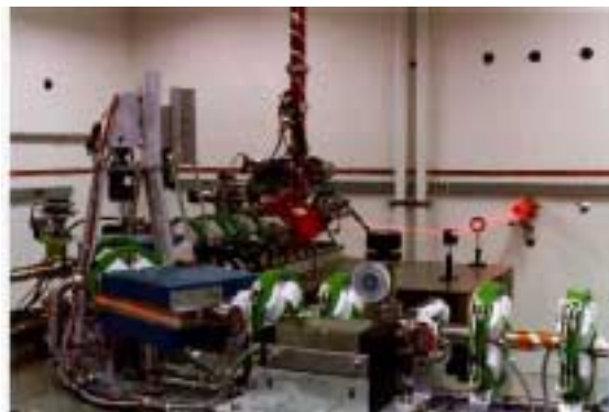
Laser Electron Accelerator Facility for BNL

AES specializes in the design and fabrication of high-brightness electron accelerator systems with photocathode electron injectors. Both single shot and macropulse operating formats can be delivered. These AES systems find application in medical, free-electron laser, pulse radiolysis R&D and other applications.