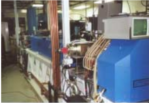
Monochromatic X-ray Imaging System (MXIS) Linac at Vanderbilt Univ.

chambers. While most of our systems to date have operated in S-band, we can also produce L-band and X-band systems as well as systems with thermionic cathodes.