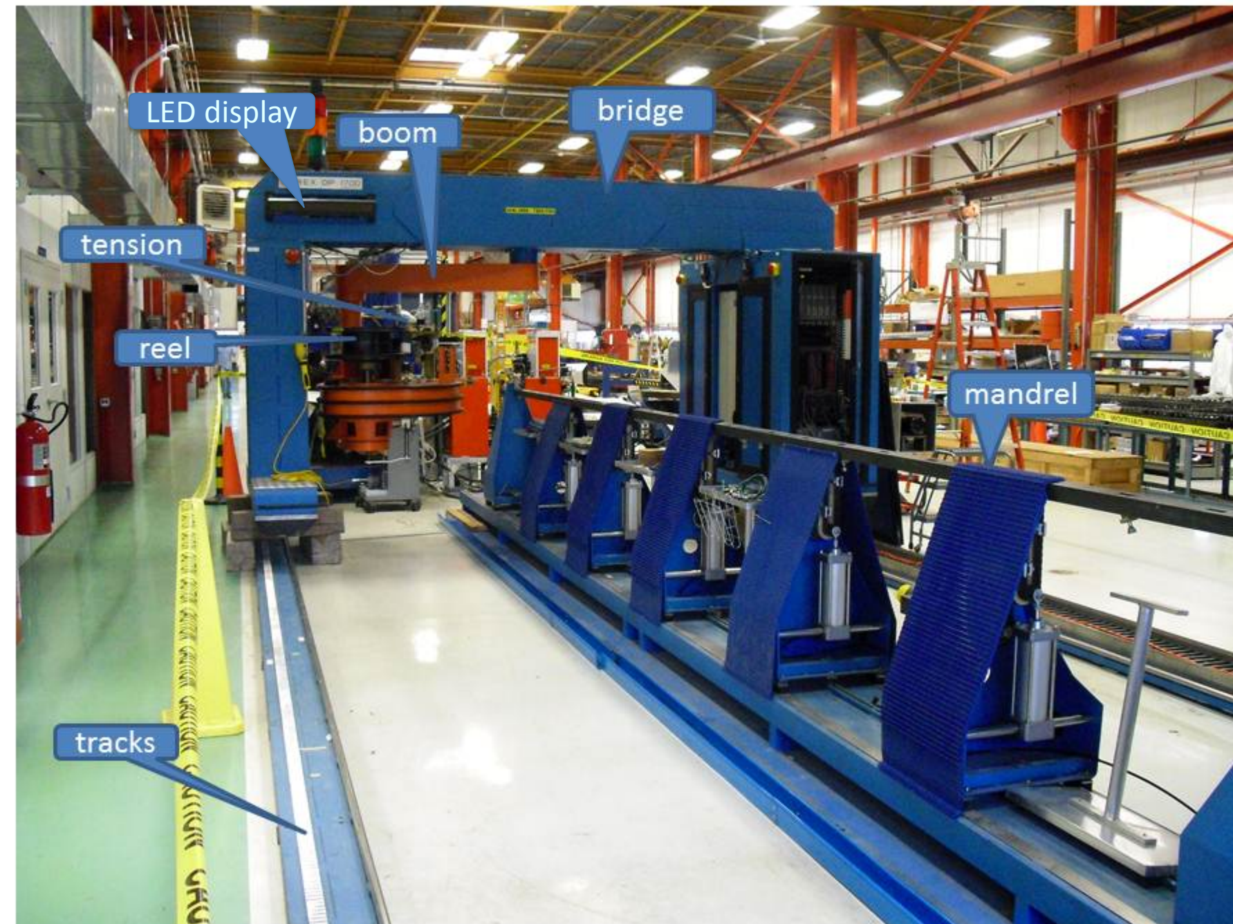
Coil winding machine

The winder machine is about 11 m long with a bridge that moves along a track and supports a rotating boom holding a spool of cable and providing cable tension. The coil being wound is supported by a mandrel.