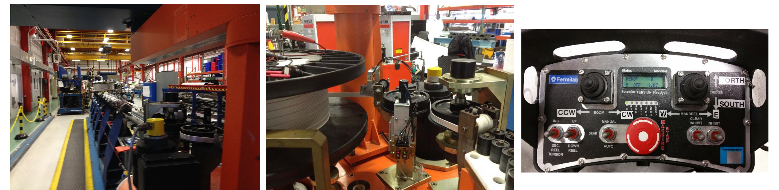
View of the mandrel from the boom