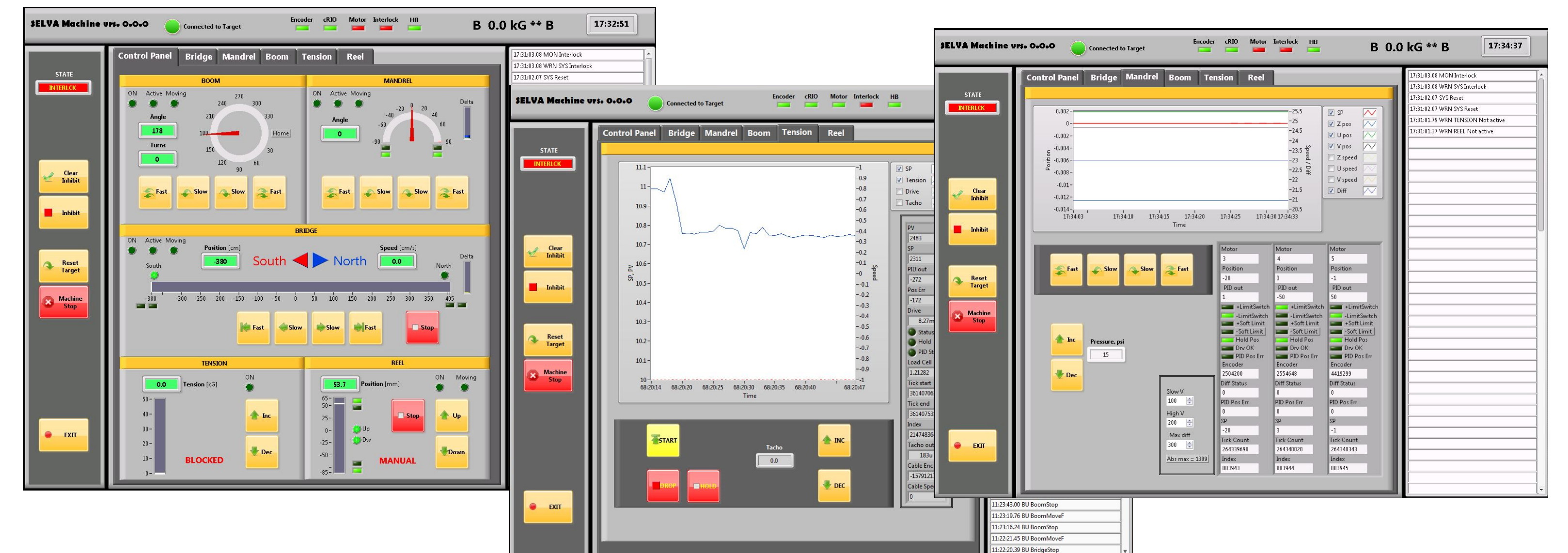
Touchscreen GUI's, including the main screen, tension, and mandrel position