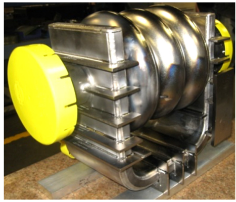
Figure 4: Fabricated 3-cell traveling wave cavity [10].

If given high priority, the construction of the 250-GeV center of mass energy HELEN collider could start as early as 2031–2032 with first physics in ~2040. The HELEN collider can be upgraded to higher luminosities in the same way as was proposed for the ILC or to higher energies (up to 500 GeV at Fermilab site) by extending the linacs.