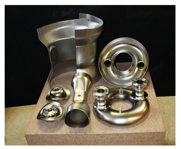
Figure 3: The niobium subassemblies which will be welded together to make the HWR. The parts clockwise from top left are outer-conductor halves, toroids, inner-conductor, and re-entrant noses.

of forward power. Following this conditioning the performance given in figure 2 was observed. Note that the residual resistance of the cavity at low-fields is less than 4.5 n \Omega at 4.2 K and 2.5 n \Omega at 2.0 K. The gradients presented in figure 2 were not limited by any fundamental phenomena, e.g., defect-initiated quench or field emission. The results were limited administratively to avoid exceeding the ANL limits on x-ray production. The cavity is only partially shielded behind a high-density concrete wall and is not in a complete cave-like enclosure. This allows considerable x-ray shine to reach experimenters. To reduce the average x-ray production the cavity was operated with a 1.6% duty cycle to safely comply with the ANL guidelines. The data points measured in this manner are highlighted in green and are the three highest gradient 2 K measured data points. Please note that the cavity dissipated power measurement accuracy decreased due to measuring these data points in the over-coupled limit but the relative accuracy of the field amplitude is unchanged. The highest data point measured was repeatable and corresponded to a voltage gain of 7.4 MV and peak surface fields of 165 mT and 117 MV/m. At no point was the QWR tested here quenched. The high field data points do not represent a fundamental limit on the cavity performance. With additional radiation shielding the maximum performance of this cavity can be determined.