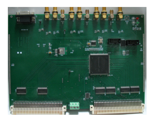
Figure 3: The timing extension hardware

Copyright © 2012 by the respective authors — cc Creative Commons Attribution 3.0 (CC BY