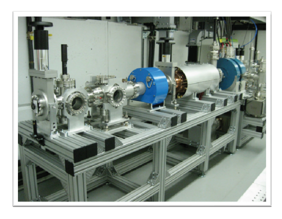
Figure 1: The new AWA RF gun (between the blue solenoids), followed by the first one of the six new linac tanks, another focusing solenoid, and two vacuum crosses for laser beam input and beam profile measurements (YAG screen). A combination of ICT and FCT (Integrating Current Transformer and Fast Current Transformer made by Bergoz) is installed in between the two crosses.

A new one-and-a-half cell RF gun (Fig.1) has been commissioned, and it will replace the existing RF gun as the source of drive bunches. The new RF gun operates with a Cesium Telluride photocathode, and thus, due to the higher quantum efficiency of Cs<sub>2</sub>Te, it will be able to generate longer bunch trains with high charge per bunch. We plan to generate trains with up to 32 electron bunches, each separated by one L-band RF period, and with up to 100 nC per bunch. (It should be noted that the two upper limits, i.e. 32 bunches and 100 nC per bunch, cannot be reached simultaneously, since this would load the accelerating fields in the RF gun to an unacceptable level.) These longer bunch trains will, of course, generate longer RF pulses when traversing the wakefield structures.