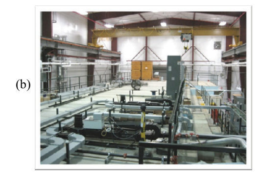
Figure 4: The expanded AWA bunker: (a) plentiful interior space is now available for the installation of the new linac tanks and new beamline switchyard; (b) new RF power circulators and waveguides have been installed on the roof of the expanded bunker, ready to connect the new klystrons to the new linac tanks.