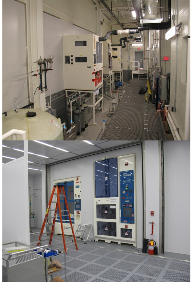
Figure 2: BCP and HPR tools bulk-headed into new cleanroom.

The TEDF project provides new infrastructure, but not new equipment. The BCP acid etch cavity processing tool, high pressure cavity rinse tool, and vertical electropolish development tool have been relocated into the PSA, with front face open into the new cleanroom. (See Figure 2.) Hook-up and commissioning of the process tools are underway. The horizontal electropolish system, used for the 12 GeV Upgrade cavities and ILC cavity R&D, has been relocated into the production chemroom and is being recommissioned.