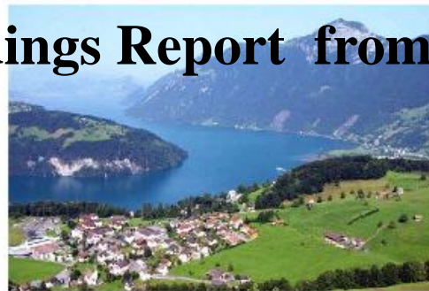
Aerial view of Morschach with Lake Lucerne.

The fifth meeting in a series of workshops focused on High-Intensity, High-Brightness Hadron Beams will be hosted by the Paul Scherrer Institut, PSI. HB2010 continues the tradition of successful workshops held in Batavia (2002), Bensheim (2004), Tsukuba (2006) and Nashville (2008). The program covers experimental and theoretical advancements associated with high-intensity and/or high-brightness hadron beams, beam dynamics studies, reviews of planned projects, and practical experience gained with operating accelerators. The workshop is intended to provide a venue for detailed discussion and close interaction among experts in the field of accelerator science and technology.