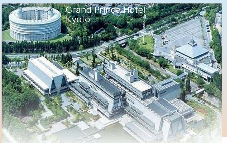
Whole view (with Prince Hotel)