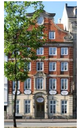
Dinner at the famous Gröninger brewery