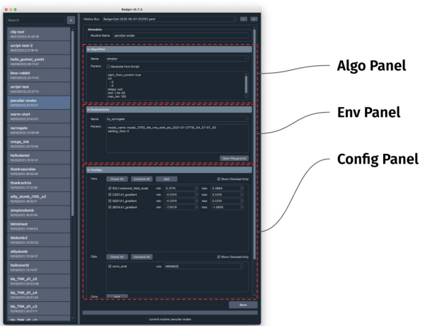
Figure 3: Badger routine editor. With the routine editor, users could select the optimization algorithm and environment to use, change the hyper-parameters for the algorithm and the environment, and configure the variables, objectives, and constraints (VOCs) of the routine.

released, they could be integrated into Badger by simply putting the whole plugin folder under a specific directory managed by Badger.