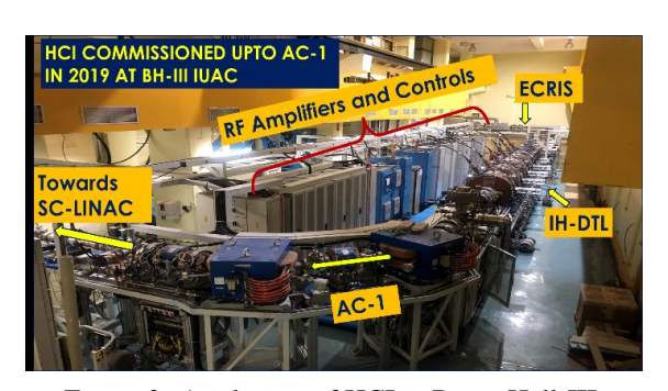
Figure 2: Arial-view of HCI in Beam Hall-III.

The first beam test was planned in HCI for the acceleration of N^{5+} beam having A/q 2.8. The ariel view of HCI accelerator facility can be seen in Fig. 2. There were various RF power levels required for each of the cavity to achieve the designed acceleration voltages and energy gains. Since, high power RF conditioning of the RFQ and six DTL cavities were completed for this test in the early of 2021 and the cavities were kept ready for the beam acceleration. Maximum RF power required for RFQ and six DTL cavities to get the design energy gain for N^{5+} were calculated and shown in Table 1.