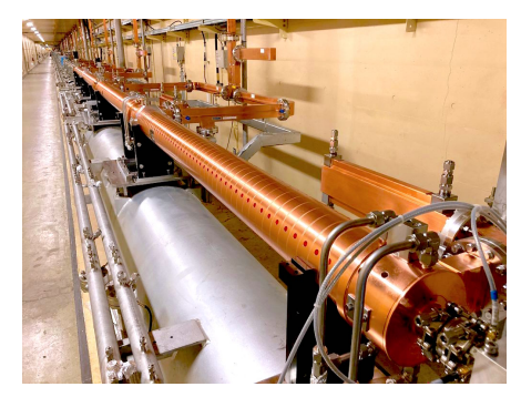
Figure 4: New S-band accelerating structures installed in the tunnel.

150 accelerating structures of total 230 in LINAC are 40 years old with initial designed gradient of 8 MeV/m but with 20 MeV/m now. As they are degraded by long-time discharges and cooling water leaks, the accelerating gradient becomes lower and we cannot reach \Upsilon(6S) state. Therefore, we are replacing 16 accelerating structures before 2023 as in Fig. 4, in order to realize the experiment at \Upsilon(6S) state [19]. We will determine whether further replacements are necessary or not.