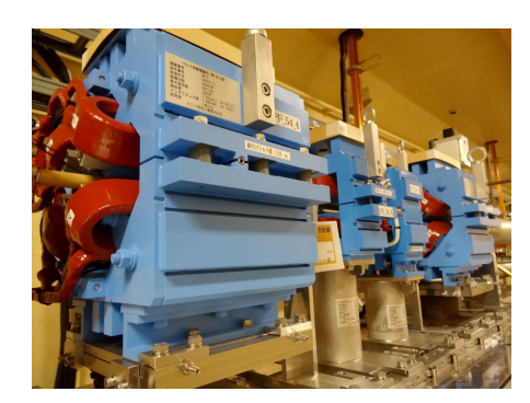
Figure 2: Example of pulsed magnets installed in the linac.

One of the reasons of orbit deviation was attributed to the building distortion, and it was found that the seasonal