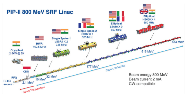
Figure 1: Overview of the significant IKC for PIP-II. Flags highlight which country plans to contribute to PIP-II Project. The flags are in the areas of the specific contribution.

A unique aspect of the PIP-II Project is that it is the first U.S. Department of Energy (DOE) funded particle accelerator to be built with significant international participation. Figure 1 shows a schematic overview of the PIP-II Linac IKC from partner countries indicated by flag. PIP-II will be the highest-energy and highest-power continuous-wave (CW) proton Linac ever built, capable of delivering both pulsed and continuous particle beams.