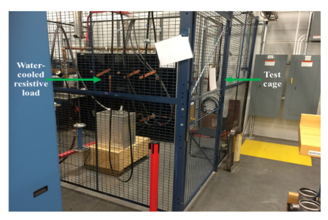
Figure 1: Test cage with water-cooled resistive load.

water leaks and improves reliability. The SMPS outperformed the SCR PS in major areas like efficiency, power factor, power losses and stability as will be discussed in detail in the upcoming sections.