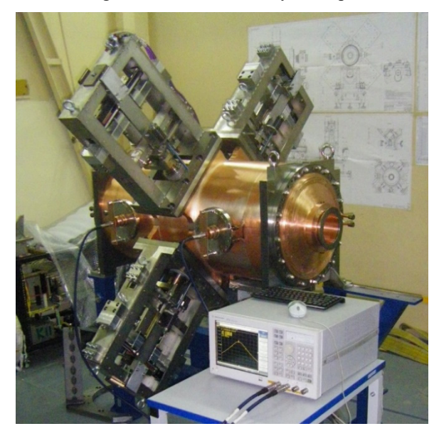
Figure 4: RF2 cavity prototype.

The cavities are formed by a few basic units: outer shell with various flanged ports, two coaxial inserts, four segment tuners and accelerating gap short. All units are dismountable from their ports except the tuner segments which are installed into the ports from inside and TIGwelded to the flanges. Cavity parts are made either from OFE copper or stainless steel and brazed or TIG-welded together. The RF2 tuner has complicated driving system which consists of a stepping motor and piezo actuator while the RF3 tuner has only a stepping motor drive.