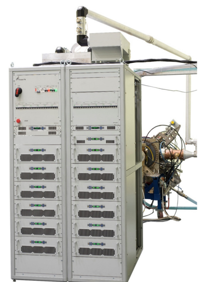
Figure 5: RF3 SSPA connected to the prototype cavity.

RF3 SSPA occupies two cabinets (with output PC installed of the cabinets on top W \times D \times H = 1150 \times 1500 \times 2420 \text{ mm}^3 ) and provides up to 40 kW in the frequency range from 34 to 39 MHz (Fig. 5). Two independent RF2 SSPAs providing up to 7 kW within 11-13.5 MHz each occupy a single unit of 2 cabinets - 1 full width cabinet with amplifier pallets and 1 half-width cabinet with power supplies and control electronics (W \times D \times H = 1000 \times 1200 \times 2000 \text{ mm}^3) . Both SSPAs have 50 Ohms coaxial outputs - EIA 1 5/8" and 3 5/8" for RF2 and 3.