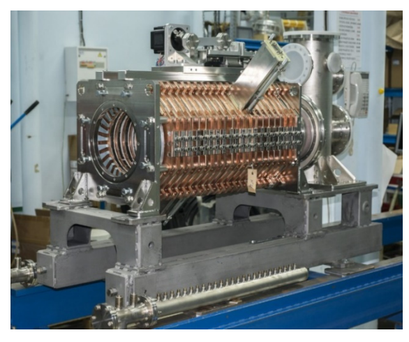
Figure 2: Photo of the RF1 cavity during its assembly.