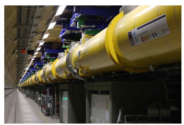
Figure 1: Completed main accelerator in one single tunnel. On top accelerator modules and cable trays. Below RF stations, electronic racks, power and water supply etc.