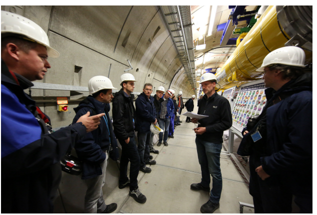
Figure 3: Weekly meeting in the accelerator tunnel at the site of installation

In contrast to other approaches it was assumed that the process could be speeded up permanently because of the growth of experience in the interaction of the WPs. So in the on-going installation each opportunity was caught which allowed to start a process step earlier than originally planned. In addition, the initial plan # 1 was optimized three times, from one cryo-string installation to the next.