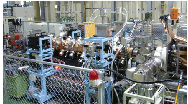
Figure 1: J-PARC RFQ test stand at J-PARC linac building.

55 mA and a duty factor of 5%. This parameter is similar to the specification of the J-PARC RFQ [2] [3], thus can be achieved without additional development. We had constructed a test stand for J-PARC RFQ in the J-PARC linac building [3] (Figure 1), and the potential of this accelerator is 50 mA with 3% duty factor.