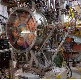
Figure 1: Stages of mechanical work – vacuum vessel under the portable clean room with flange plate replaced (top left); inspection of coupler loop through mirror (top right); vessel after coupler replacement (bottom, left); temporary transparent cover plate installed for protection during crane access (bottom, right).