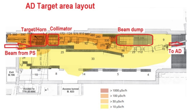
Figure 2: Layout of the production target area.

inspection capabilities is also being performed. The hydraulic and electronics of the existing service vehicle – capable of remotely disconnecting the target and horn carriages as well as the magnetic spectrometer dipoles/quadrupoles – has been completely refurbished. In collaboration with other CERN programs, a dedicated remotely manipulated robot will be used in the area for general inspections, reducing the dose rate for personnel intervening in the area.