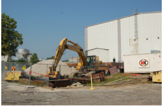
Figure 4: Construction of new building annex to house the expanded AWA bunker.

Concomitantly, AWA is undergoing upgrades that will enhance its capabilities. These upgrades will allow the generation of longer bunch trains with high charge per bunch. The higher beam energy will make it possible to excite high gradient wakefields in longer accelerating structures, thus generating hundreds of MV/m over meter scale structures. The second RF gun will provide "witness" bunches to probe the wakefields, demonstrating high gradient acceleration.