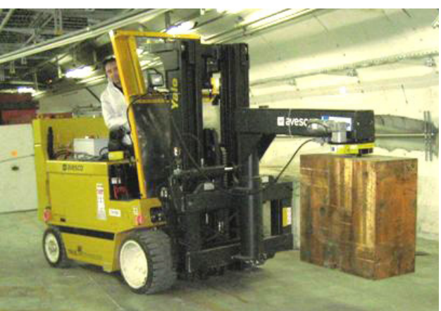
Figure 2: Shielded Forklift equipped with automatic hook.