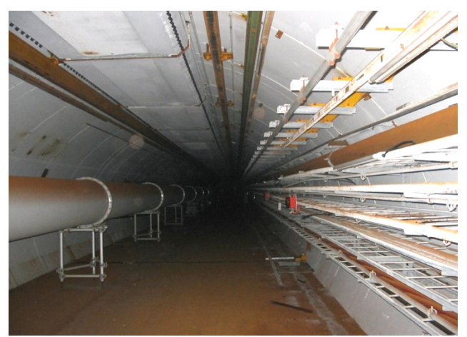
Figure 1: WANF before dismantling.

A comprehensive inventory of equipment and associated environmental conditions was issued and comprised: TAX blocks, magnets, collimators, T9 target, WANF horn & reflector, strip-lines, 100m-long Helium tubes and the infrastructure (cables, cooling circuit, air duct, shielding). After 11 years of decay without ventilation and due to the oxidation by ozone, a lot of activated dust covered all the equipment.