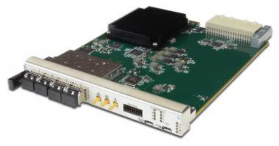
Figure 1: Vadatech AMC523 module.

platform. When selecting a hardware platform for our own product, a Dose delivery system used in medical particle accelerators for cancer treatment, the decision to go towards MicroTCA was a straightforward one.