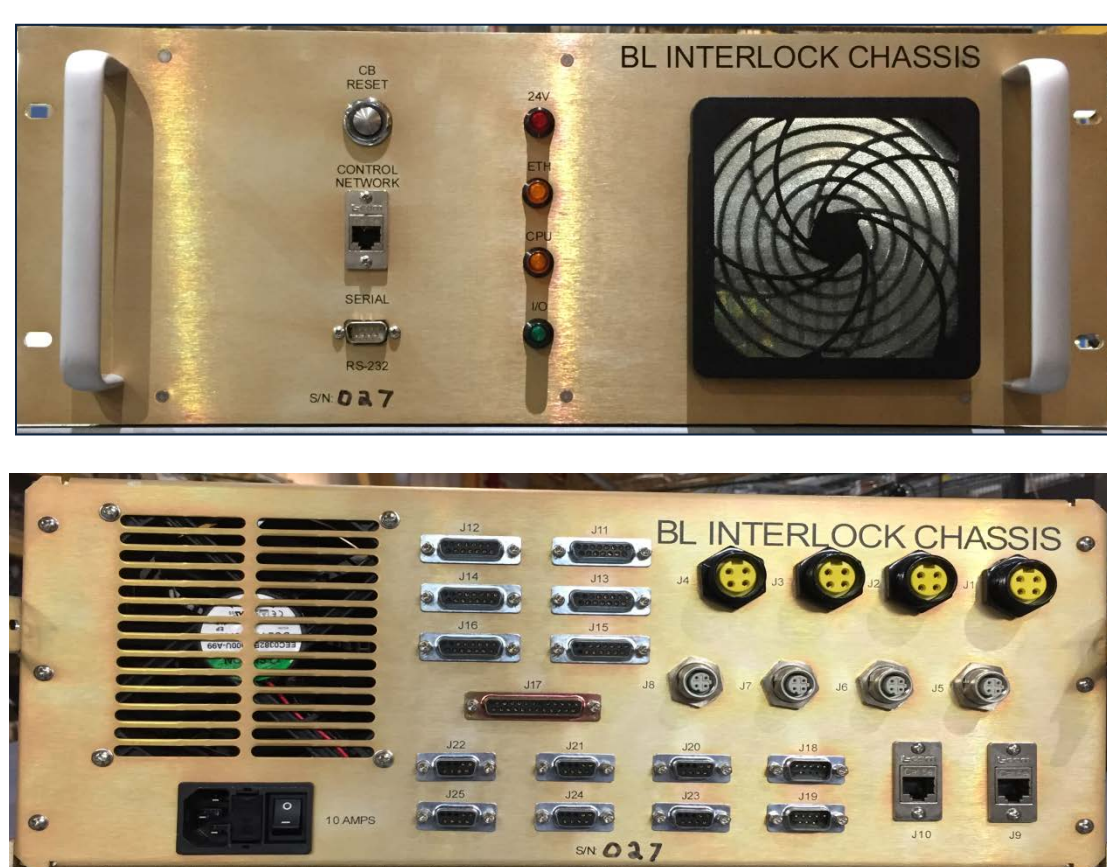
Figure 1. Intelligent Chassis Front/Rear Panel and Module Layout

Each beamline has only one PLC, e.g. one controller, which resides in the intelligent chassis.