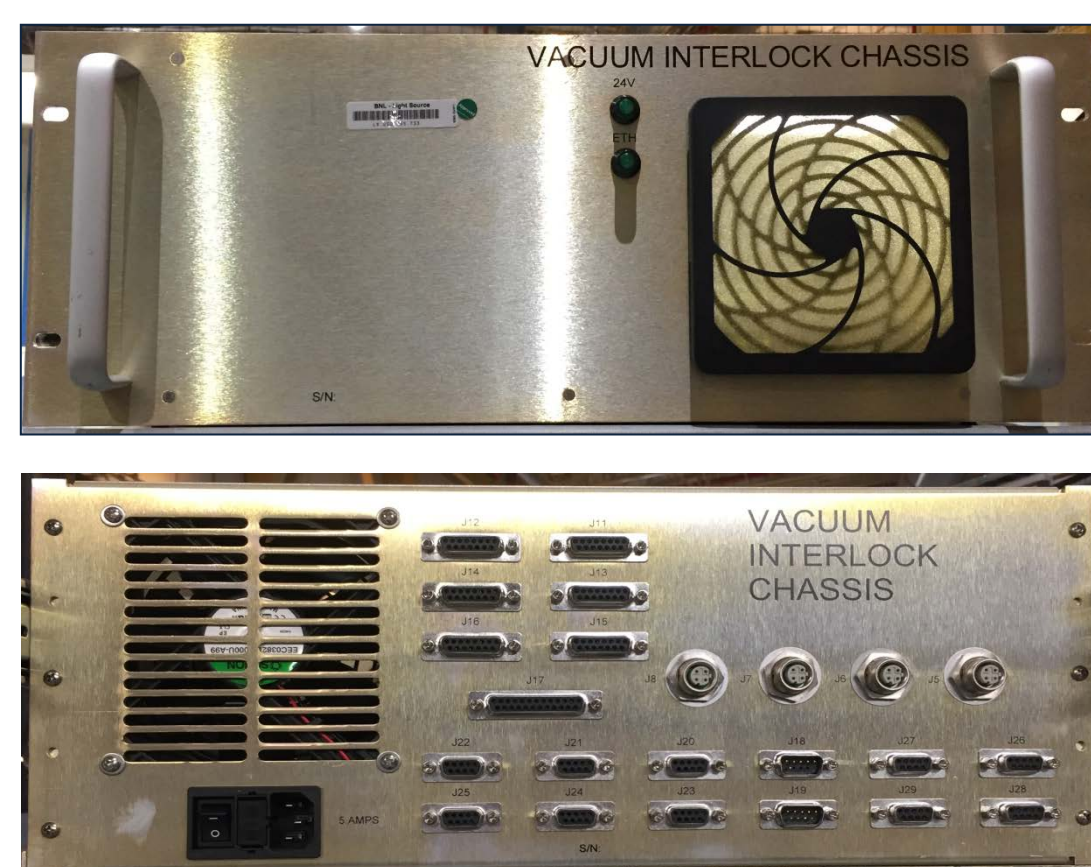
Figure 2. Vacuum Interlock Chassis Front/Rear Panel and Module Layout

Additional vacuum interlock chassis are installed in vacuum controller racks, where needed.