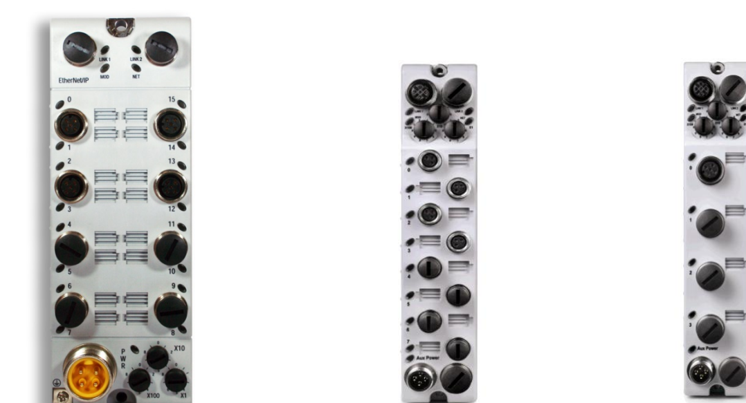
Figure 4. 1732E ArmorBlock modules

The 1732E ArmorBlock modules are mounted locally in the case of limited space and I/O signals.