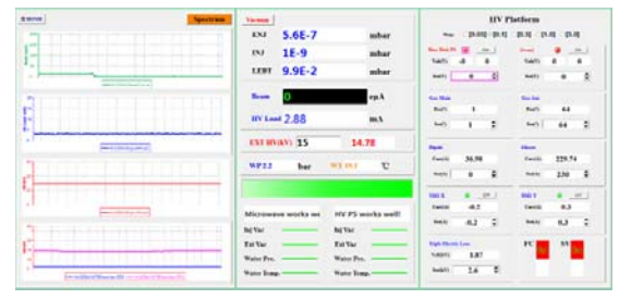
The "Adjust Beam" panel

Control System Studio(CSS) is used for rapid development. OPI has a main panel and three sub panels. Operation and monitoring is done in the "Adjust Beam" sub panel. The "Spectrum" sub panel is used to plot spectrogram and select the needed ion beam.