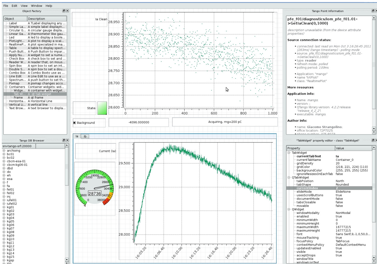
Figure 1: Mango graphical user interface.

Copyright © 2011 by the respective authors — cc Creative Commons Attribution 3.0 (CC BY 3.0)