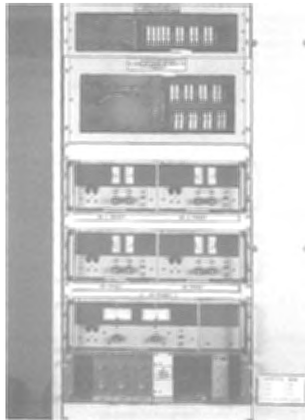
Figure 2. Typical ILC installation.

The ALS consists of an Electron Gun, a Linac, a Linac-to-Booster line, a Booster, a Booster-to-Storage-Ring line, a Storage Ring (SR), and a number of user beamlines. The control system is currently operating the existing parts of the ALS accelerator hardware consisting of the Gun, Linac, Linac-to-Booster line, and the Booster; the Booster-to-Storage-Ring line is being implemented now. The Storage Ring accelerator hardware is under construction; completion is expected sometime during the second quarter of 1992. We will then be ready to begin commissioning the SR via the control system, both locally and from the Control Room.