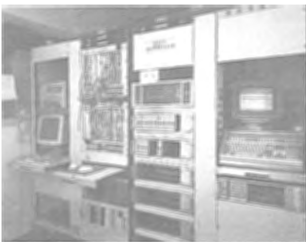
Figure 3. DMM, CMM, fiber optic interface, and file server.