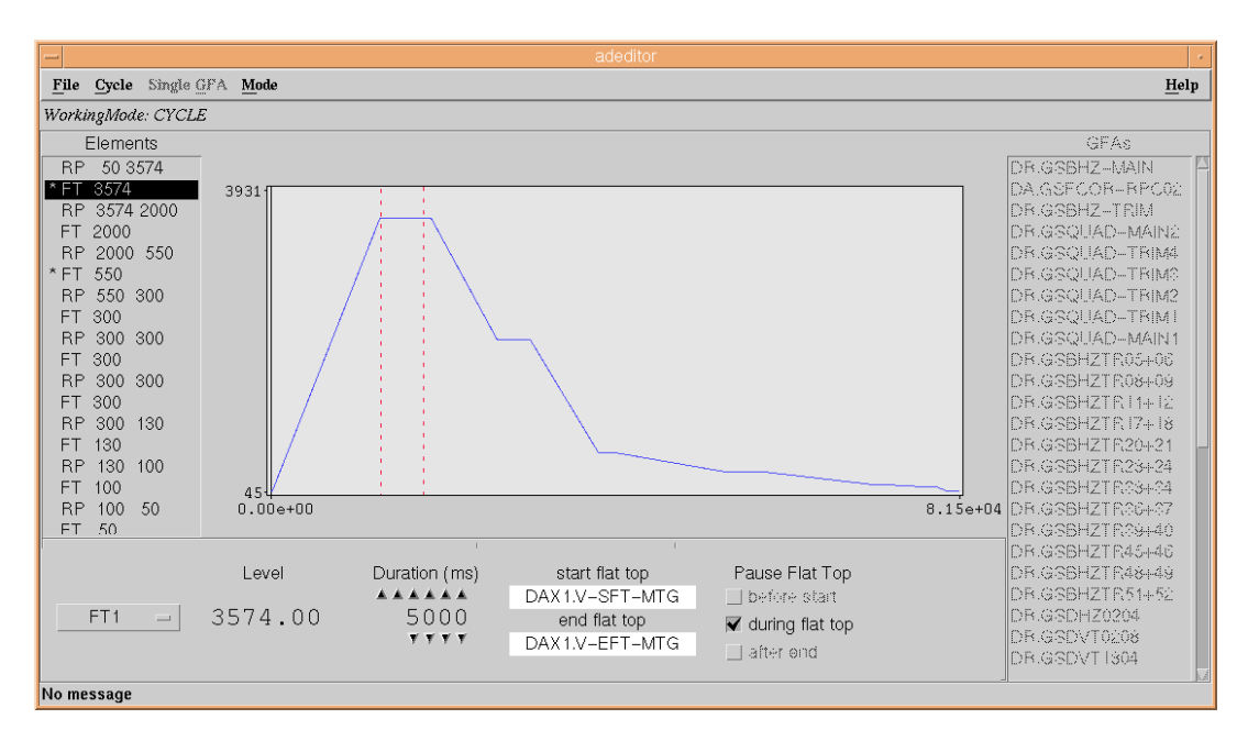
Figure 3: AD Cycle Editor