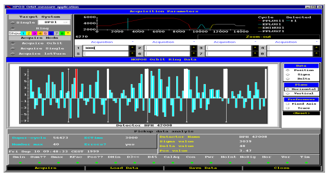
EXTENDING THE CLIENT

The deployment of the configuration client as an applet, offers great flexibility in terms of accessibility, but also introduces a new problem of security. To address this, all users must acquire a token (by supplying a user ID and password) from an intermediate gateway (operating from a Linux machine) before communication with the broker may take place. In addition, a record of all client activity is stored in the database.