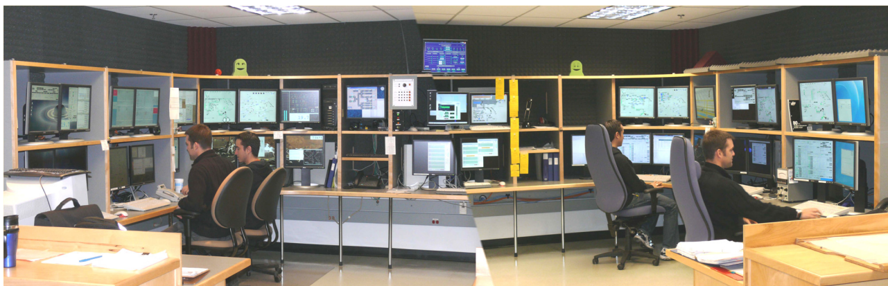
Figure 2: The new ISAC control room.

software and hardware modifications to beam diagnostics elements, such as emittance scanners. More details are given in [2].