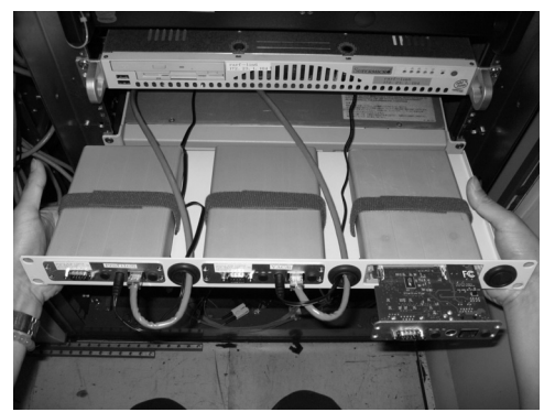
Figure 4: Three WRAPs set in the case of 1U panel.

In November 2006, we started implementation test of the WRAP installed embedded Linux of version 1.0. Afterwards, we repeated to upgrade the Linux many times and eight IOCs were implemented in RIBF control system without serious trouble till September 2007 [6]. Three WRAPs set in the case of 1U panel (see Fig. 4). The numbers of the EPICS record and the number of network device connected with the WRAP are shown in Table 3.