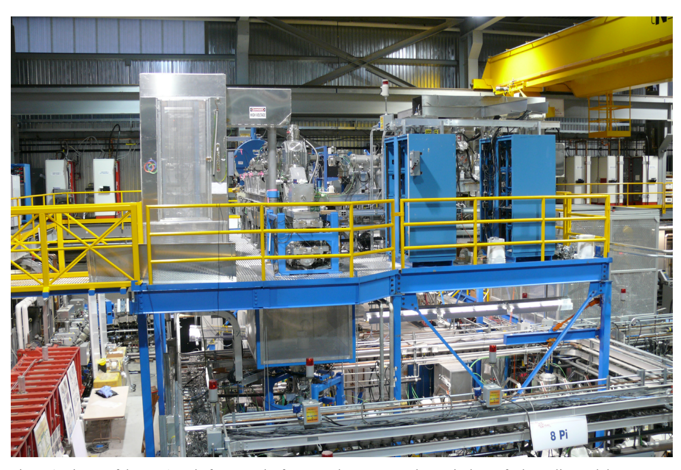
Figure 1: Picture of the TITAN platform. In the foreground one can see the vertical transfer beam line and the HV cage surrounding the RFQ cooler, in the background the circular shape of the MPET superconducting magnet. EBIT is behind the racks perpendicular to RFQ-MPET beam line.