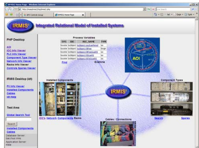
Figure 2: APS IRMIS home page.

IRMIS currently also provides information on and links to controls documents stored in the APS Integrated Content Management System (ICMS), the EPICS CVS file repository, and the Controls Group shared file directory. The dotted lines in Figure 1 indicate the potential for future software application integration and sharing of controls related data.