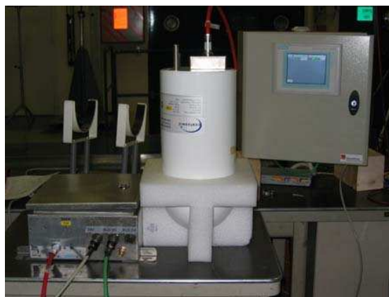
Picture 2. Monitoring station: control unit, detector assembly and ionization chamber.