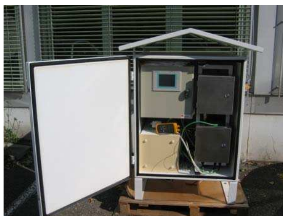
Picture 4. Monitoring station ready to be installed in the CERN environment.