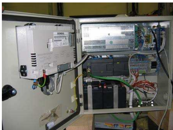
Picture 1. Inside the control unit of a monitoring station.

Here after some pictures of the RAMSES at work: