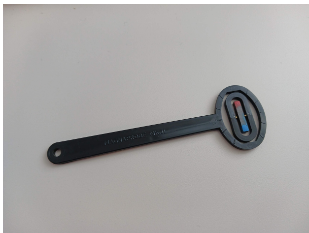
Figure 1: Polarity checker.