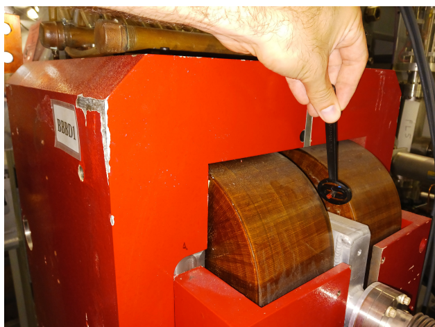
Figure 3: BBBD1. The polarity of the left pole is denoted 'red'. The beam direction in this photograph is from right to left.