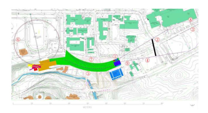
Figure 1: Current layout of Cornell's x-ray ERL.

The layout of Cornell's ERL is shown in Fig. 1. Several features have been developed further since the project description at [1]. An injector linac (1) produces 10-15MeV, 100mA beam with 77pC per 2-3ps long bunches for linac A (2). The beam is sent into a 2820GeV Turn Around (3) and is accelerated in linac B (4) to 5GeV for x-ray experiments in the undulator section (5). The beam is then returned through CESR (6) and the North undulator section (7) to linac A for deceleration, followed by a second Turn Around (8) at 2190GeV and by linac B, leading to the 10-15MeV beam dump at (9). This ERL is an extension to the