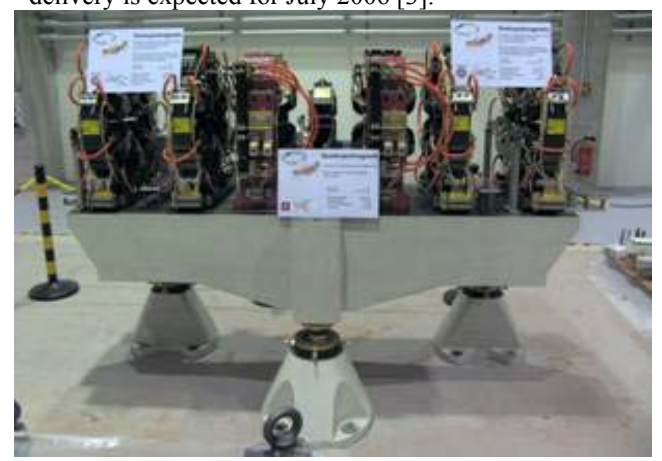
Figure 4: First assembled achromat girder in May

All the girders and multipole magnets are delivered. The assembling started end of April 2006. The bending magnets are ready for FAT at the manufacturer site, and delivery is expected for July 2006 [3].