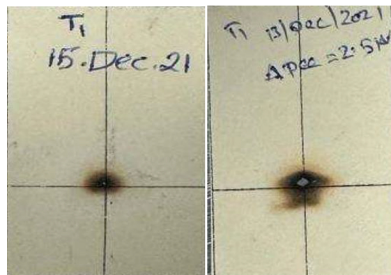
Figure 1: Here we see a paper burn test, which show the beam location and profile when it hits the target.

The I-One facility is the first cyclotron in the western region of Saudi Arabia. Building started in 2013 in King