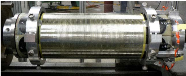
Figure 2: The hexapole coil assembly during the banding process. Coil leads and bladder inflation tubes are at the right end of the assembly.

of VENUS construction. The banded hexapole assembly before insertion in the solenoid bobbin is shown in Fig. 2.